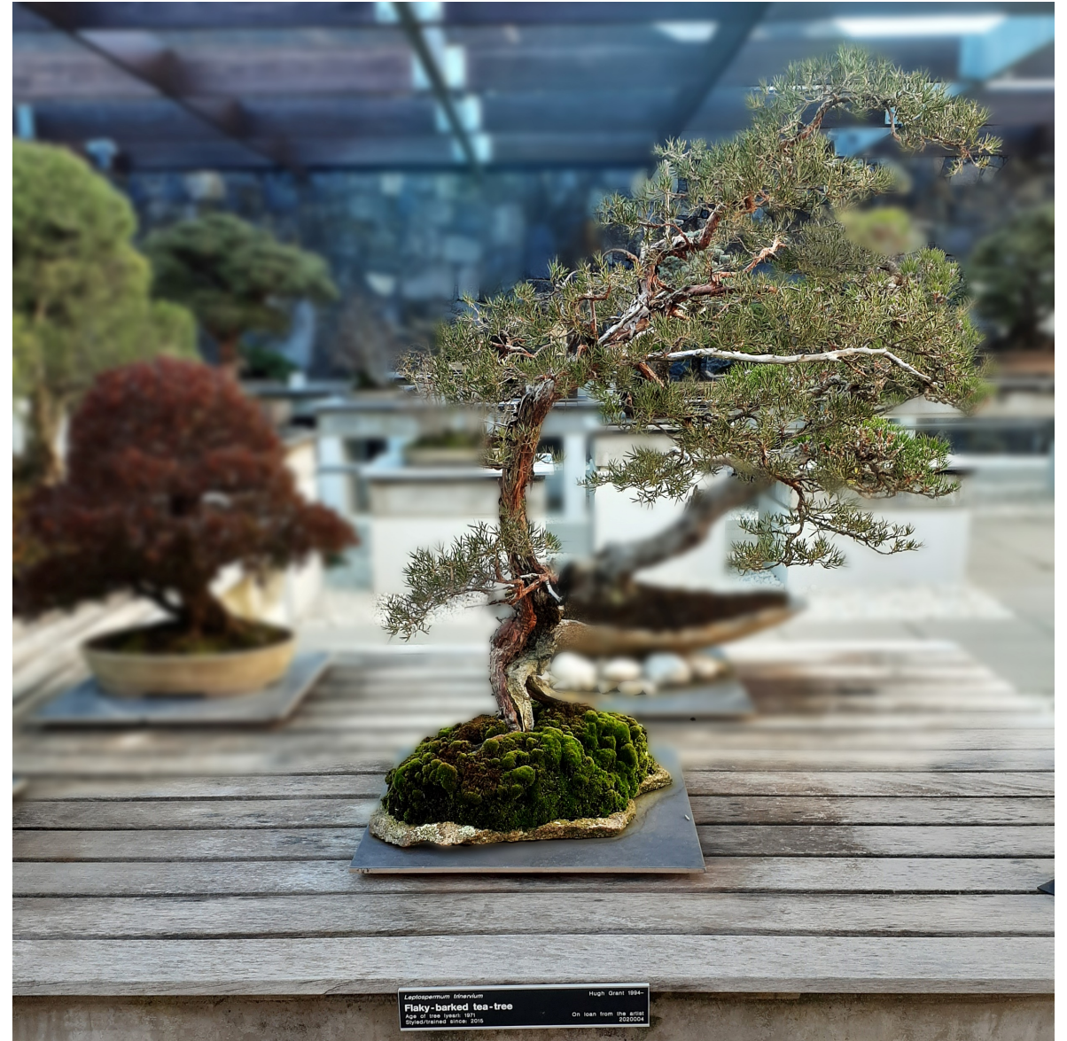
Leptospermum trinevium .